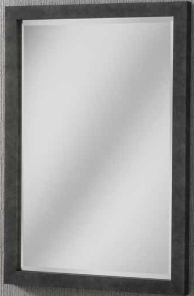
1372 Dark Concrete