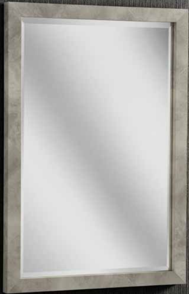
1372 Light Concrete

Login to the website to view latest prices